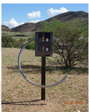
Planetary Walk & Astro Tours