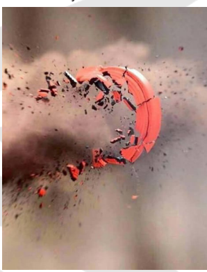
Clay Pigeon Shooting