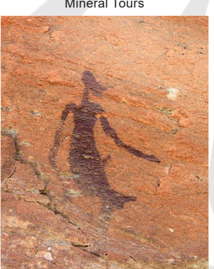
Rock Art Trails